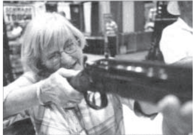
A woman checks out a rifle at a show in Orlando, Fla., for gun enthusiasts